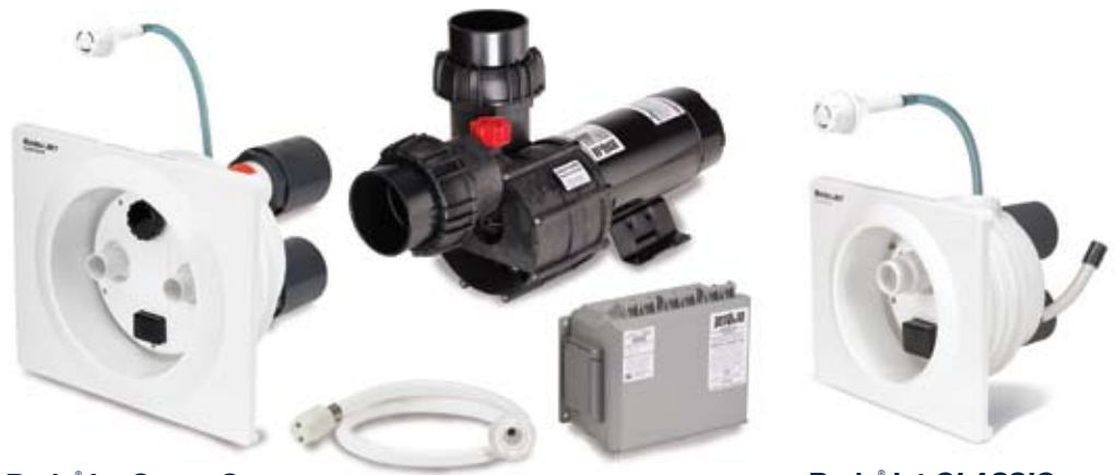
Badu®Jet Super-Sport Dual Nozzle

The full-featured Badu®Jet offers suction and discharge in the unique, patented, one-piece dual nozzle housing. Volume control and on/off button are conveniently located on the face of the jet housing.